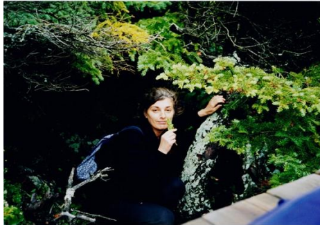
Natural beauty - Year 1988

These two pictures below show her affinity with Nature, and their beauty together.