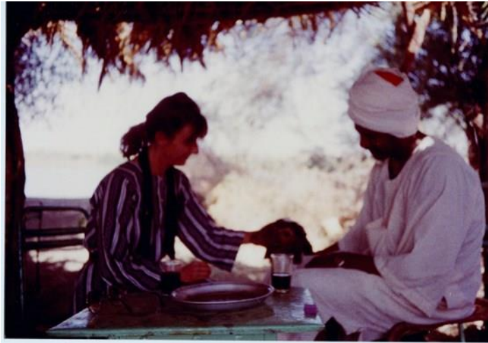
With sheep - at our favourite coffee shop on the banks of the Nile.