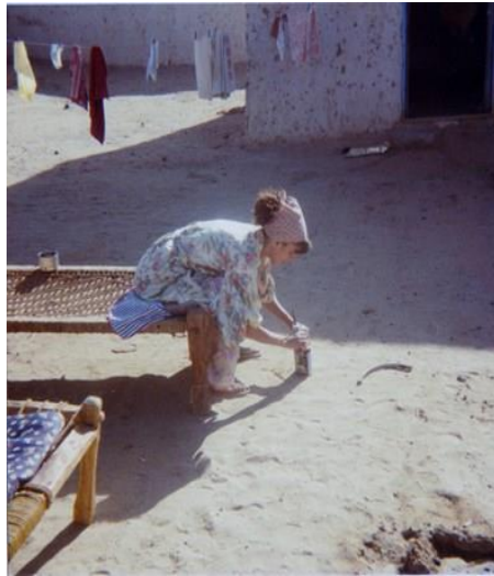
Preparing a meal