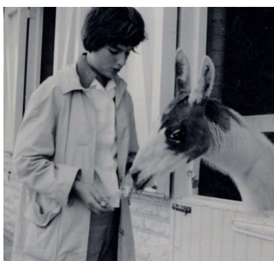
With Bambi – year 1962