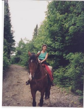
On a horse in Canada Year 1994

We met in 1978 when we were both studying for an English degree at North London Polytechnic.