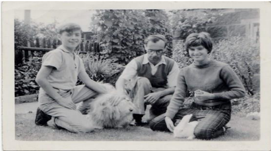
With guinea pig and rabbit (and brother and dad) Year 1959