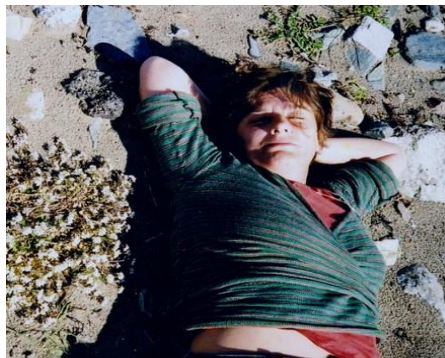
Natural beauty June 1988

She loved animals, and I often had to stop the car if she saw one in trouble.