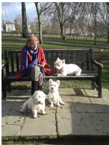
With 3 westies in Holland Park, Feb 2014