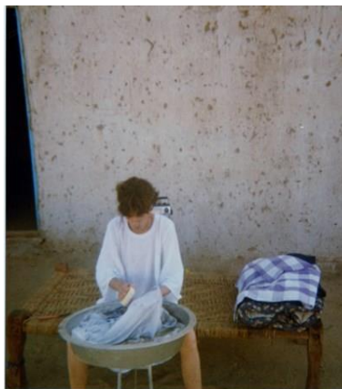
Doing the Laundry