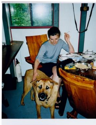
With a dog in Canada in 1985

She loved animals, and I often had to stop the car if she saw one in trouble.