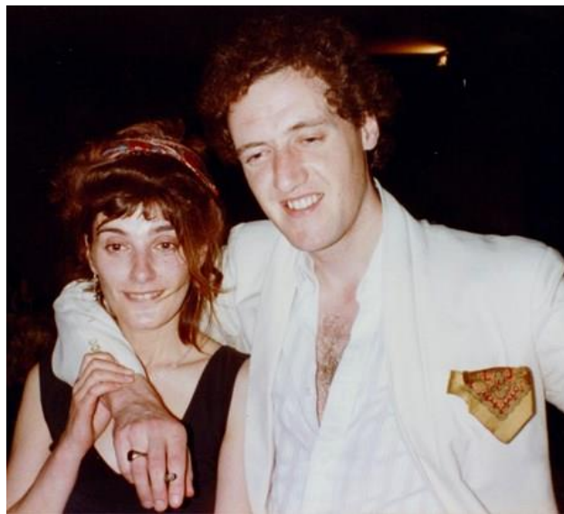
Party time in Paris Year: 2005

We met in 1978 when we were both studying for an English degree at North London Polytechnic.