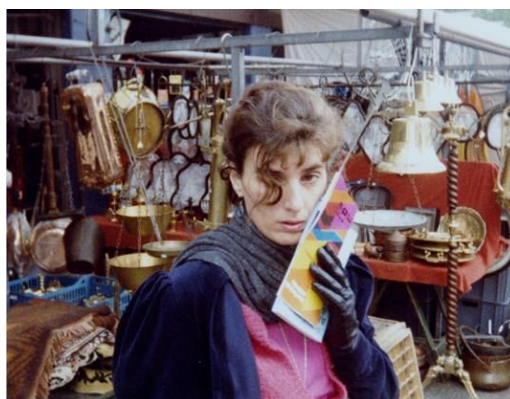
With toothache on our honeymoon in Amsterdam. Year 1984